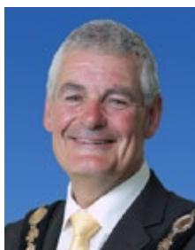
The Right Worshipful the Mayor Councillor Tim Morrow