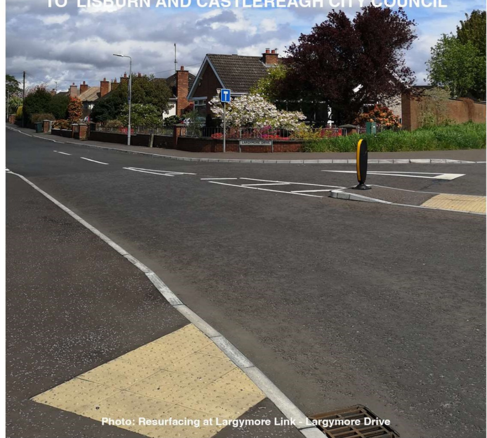
Photo: Resurfacing at Largymore Link - Largymore Drive